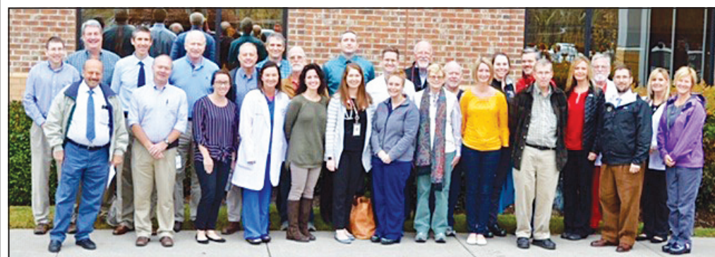
Physicians and medical staff at Union General Hospital pose for a photo to show their solidarity in support of the hospital.